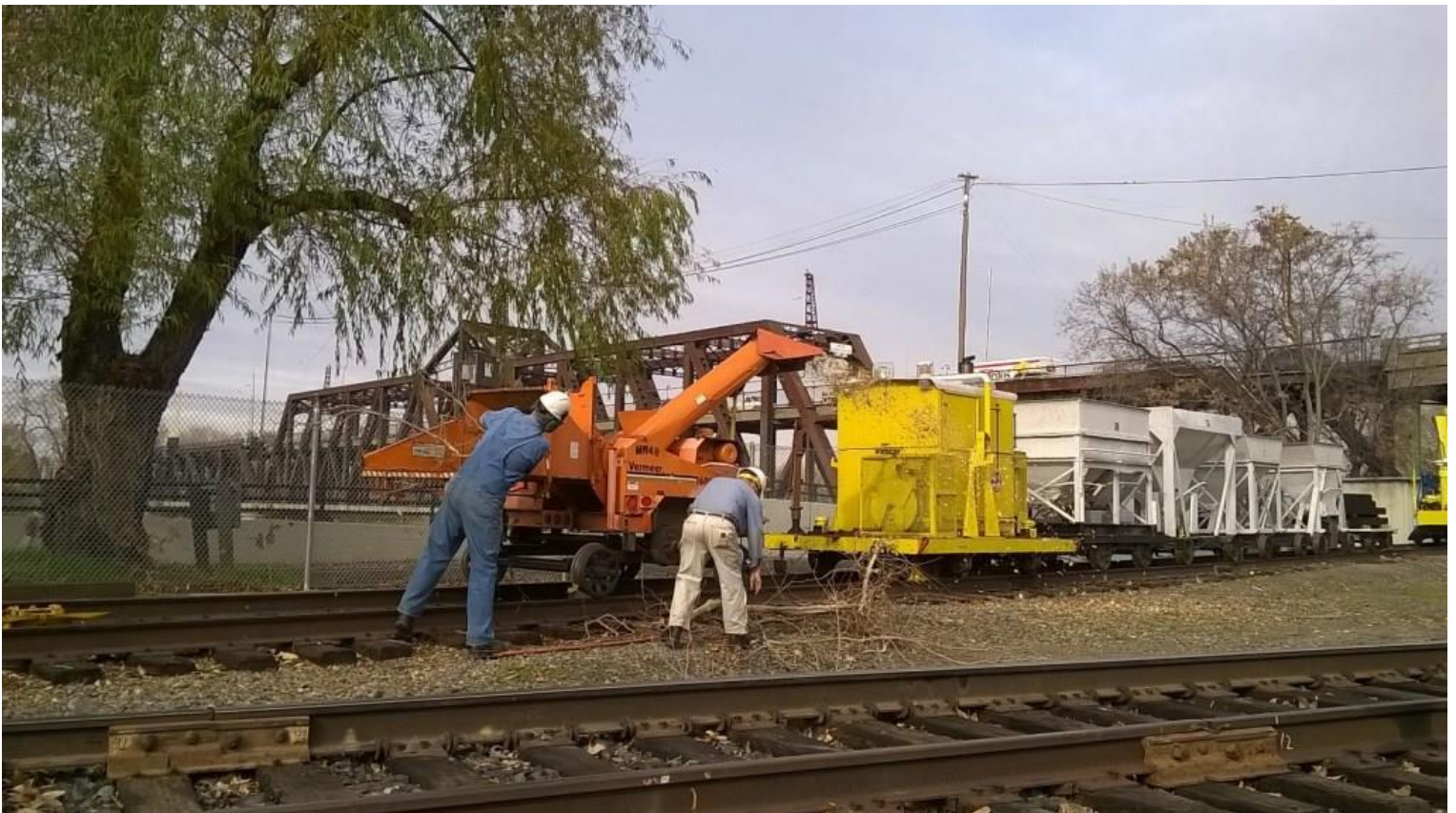
Back in town, the chipper is finally tested