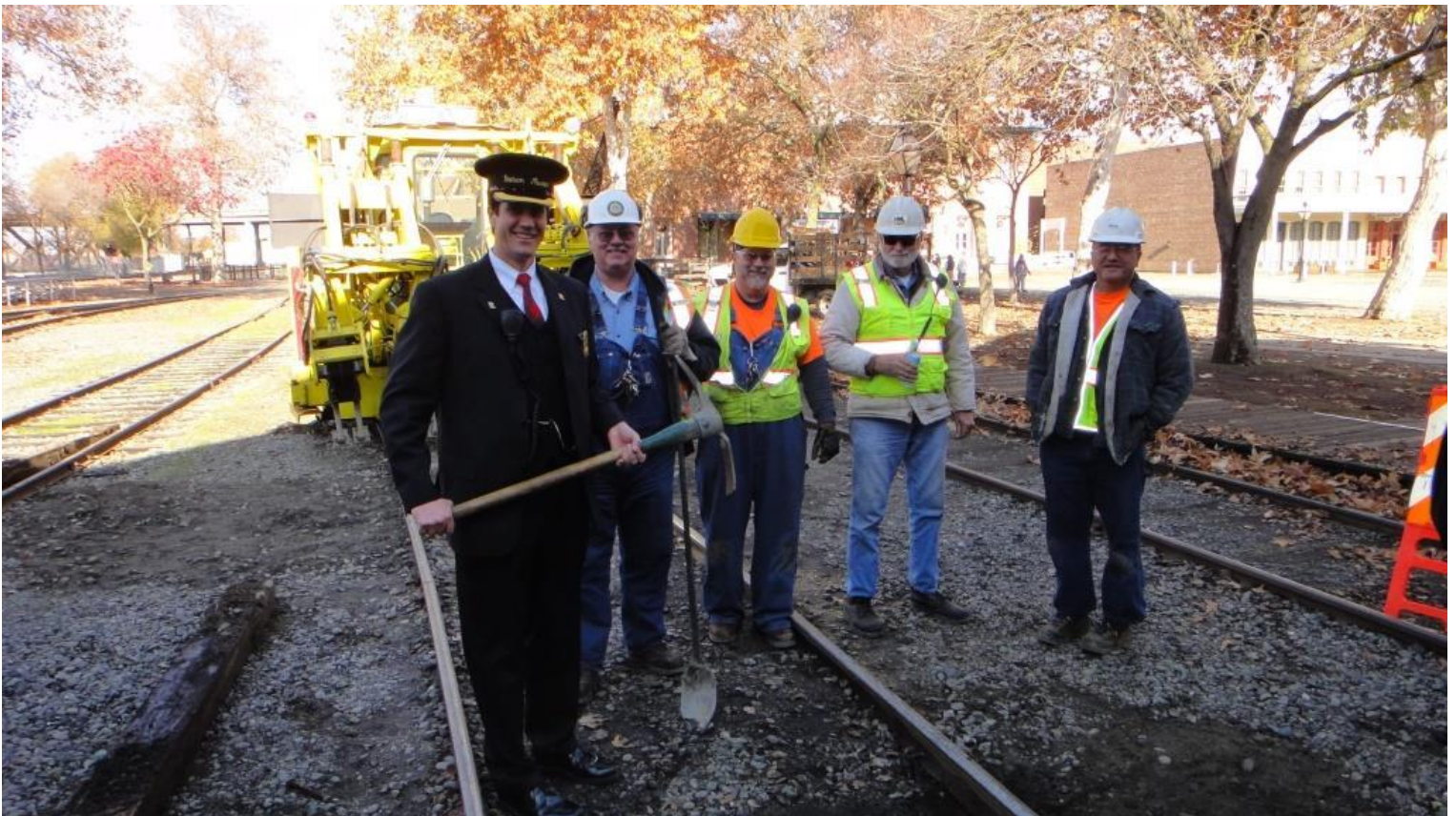
Ah, just like ol' times