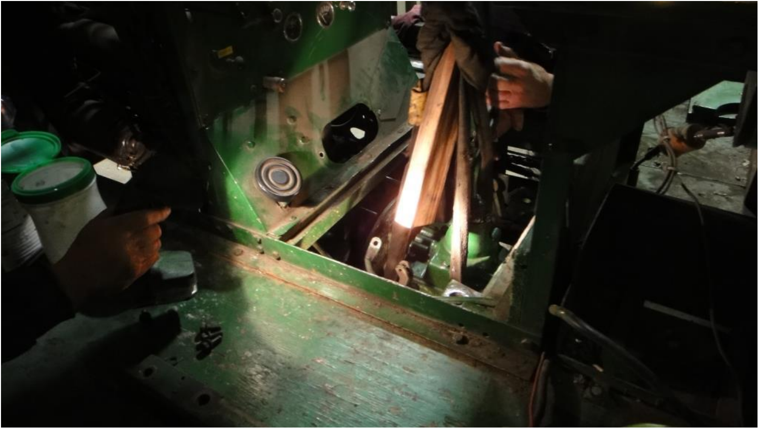
All strapped in, the transmission rises from the depths and into position