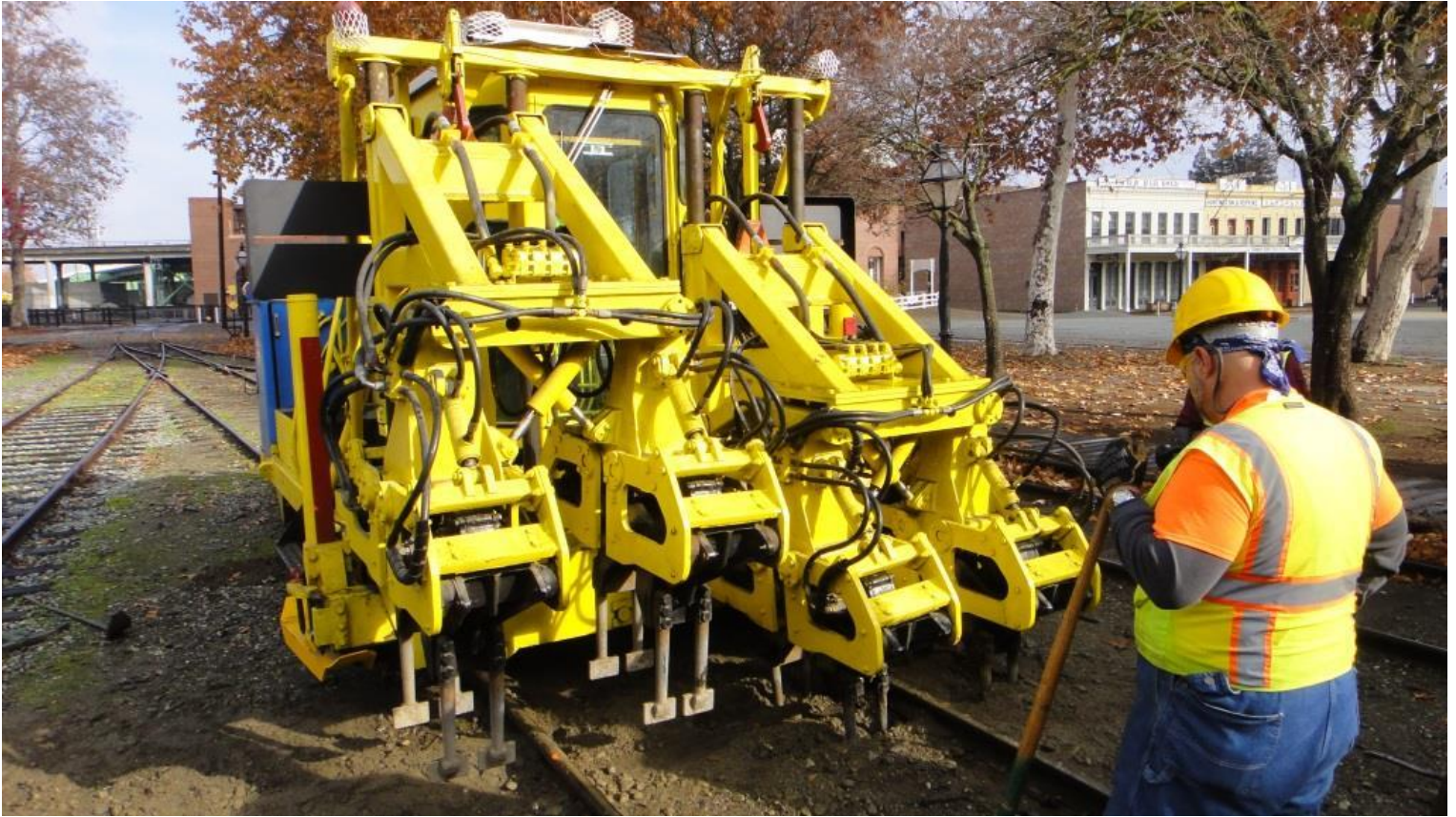
Alan in the tamper skillfully attempts to compact the mud and rocks under the ties