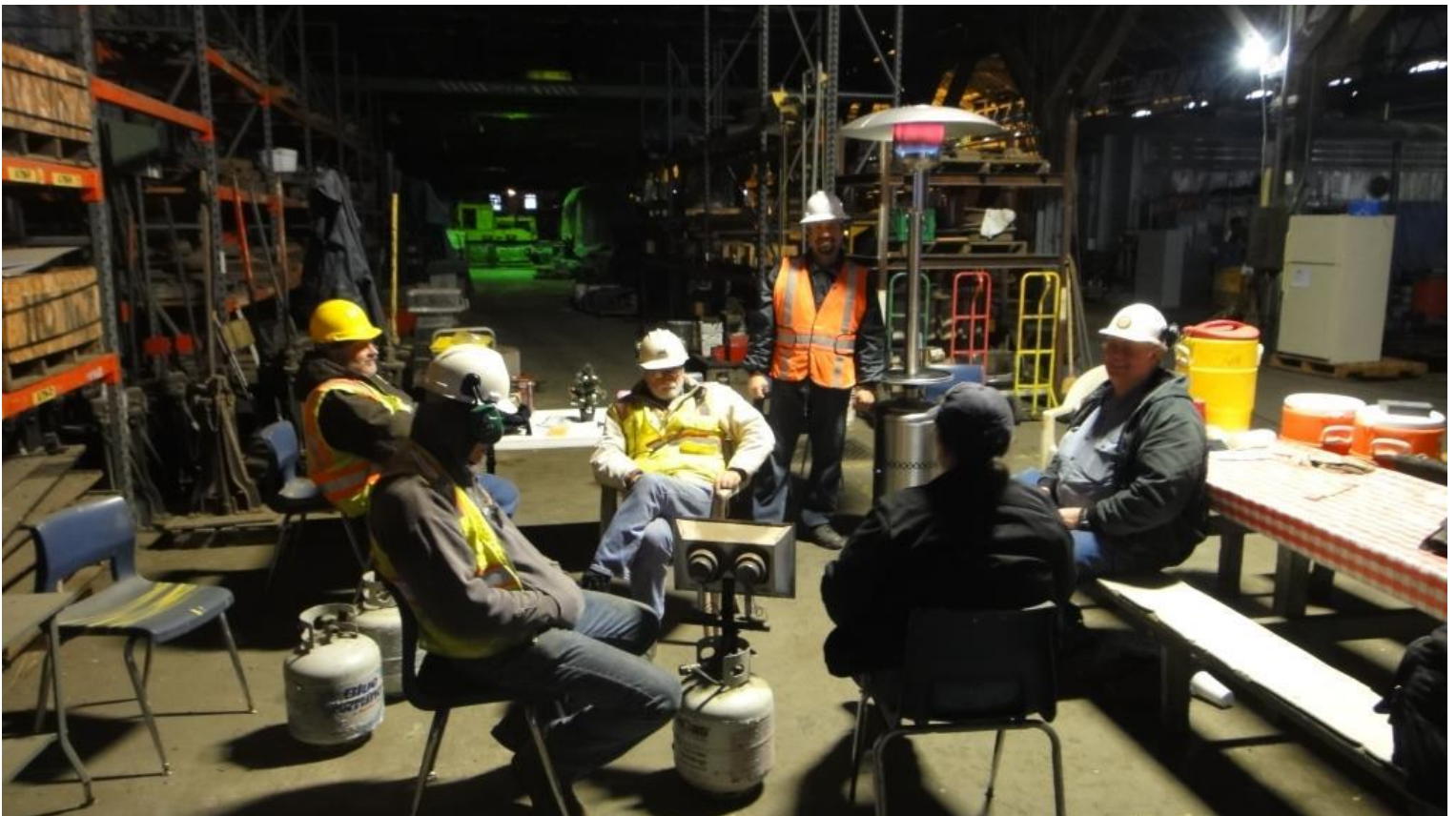
Day is done, gone the sun, and the Team debriefs under the warmth of our new heater. Thank you, Santa!