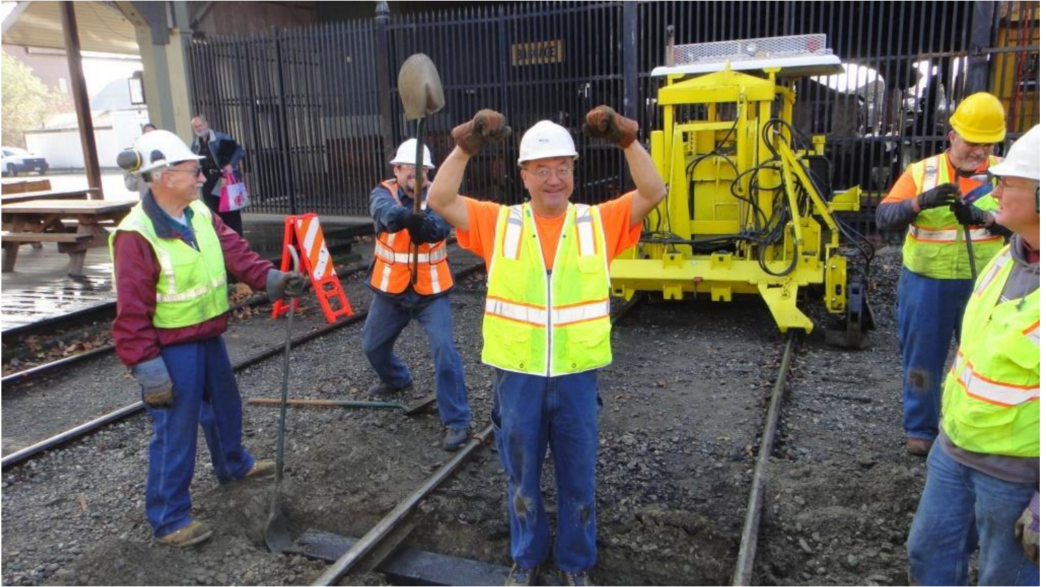
Watch out, Batman! The Joker's right behind you!